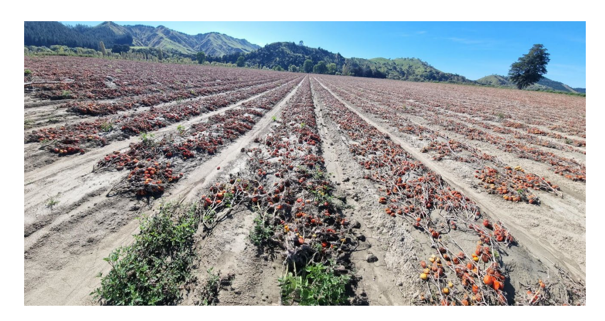
Destroyed tomatoes post Cyclone in Gisborne.