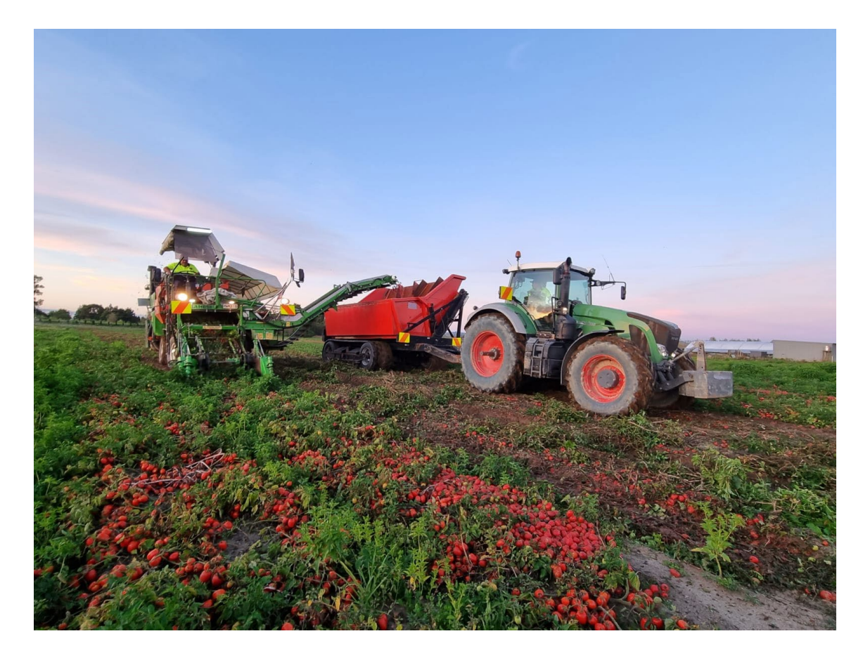
Tomato harvest in Gisborne.

This is the second disaster year in a row due to factory covid lockdowns and a cyclone last year which meant tomato growers lost thirty harvest days in March. After two years of crises in a row, it's difficult to plan ahead. Growers need to order seed in the next few weeks if they want anything to harvest in 2024, but buying that seed is not financially viable with the current damage. Government compensation and loans are the only way to ensure there will be a harvest next year. There are hundreds of jobs at stake between farms and the packhouse at peak season.