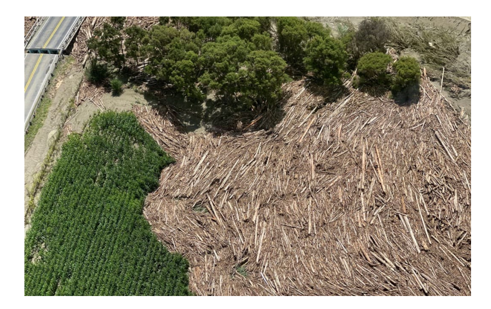
Slash backing up behind a bridge, and because of that blockage, causing a debris flow on the adjacent horticultural land.

As for the source of the silt, the clearance of native bush in favour of bare pastoral hill country is the likely culprit.<sup>30</sup> The lack of substantial vegetation to hold the soil in place creates the conditions for erosion. It is worth questioning whether it is viable to keep hillsides in place with only grass, or whether there needs to be a push for more native trees on those slopes.