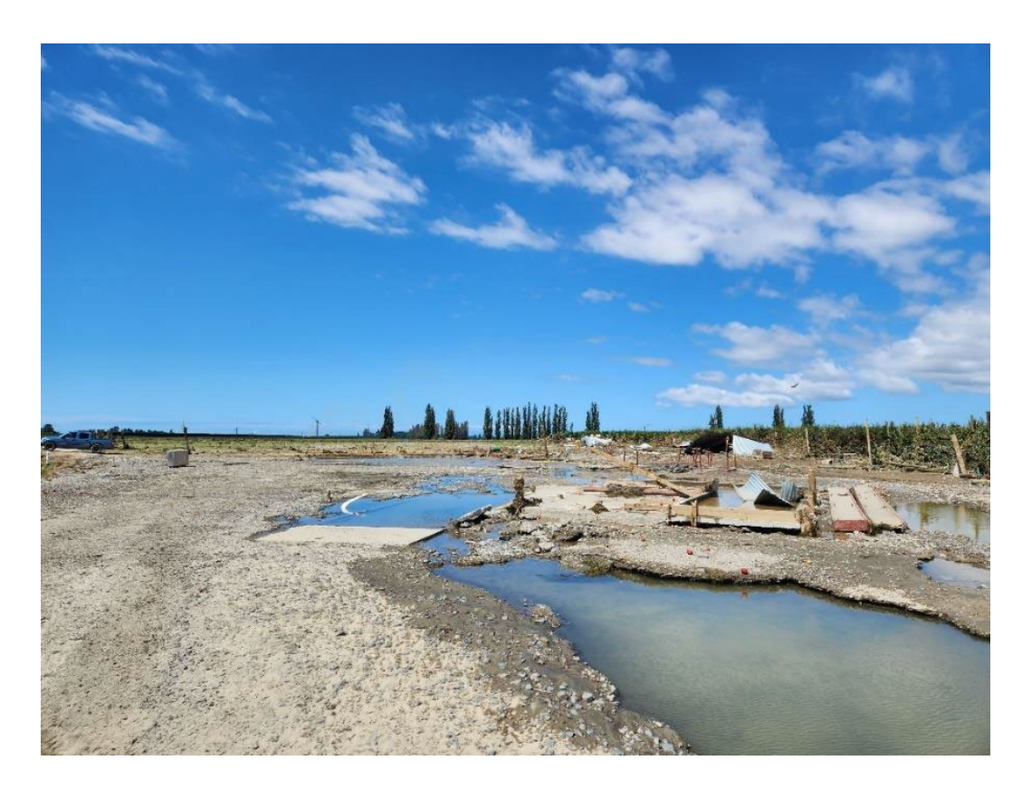
This barren paddock was once a five hectare apple orchard.

It is an open question where money will come from to rebuild businesses. One grower said that banks will not fund new capital expenditure for those impacted – if an orchardist has lost their infrastructure, radical downsizing is the only option for most. Another grower's opinion was that they won't be able to replant until their business is profitable again given lack of support from the banks – which is quite a task without trees. Getting reimbursed for crop losses is helpful, but one grower estimated that lost crop value only accounts for about 15% of the capital cost to re-establish an orchard.