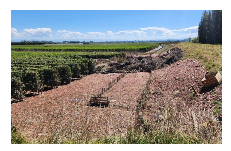
Here, the edge of a dam popped over the bank before the bridge gave way.

One grower shared that their stop banks have worked well for over a century and likely would have last through the cyclone too if not for the slash which blocked the flow of water, causing the river to artificially rise even higher. Yes, the weather was terrible, but there was a man-made component to the degree of destruction.