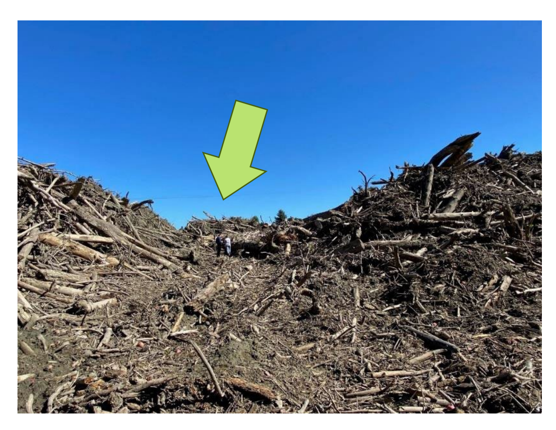
Two people stand on top of a seven metre deep pile of slash on a four hectare orchard. That makes 280,000m<sup>3</sup> of material to remove or burn.

The section below details the crop loss in both Tairāwhiti Gisborne and the Hawke's Bay across multiple fruits and vegetables.