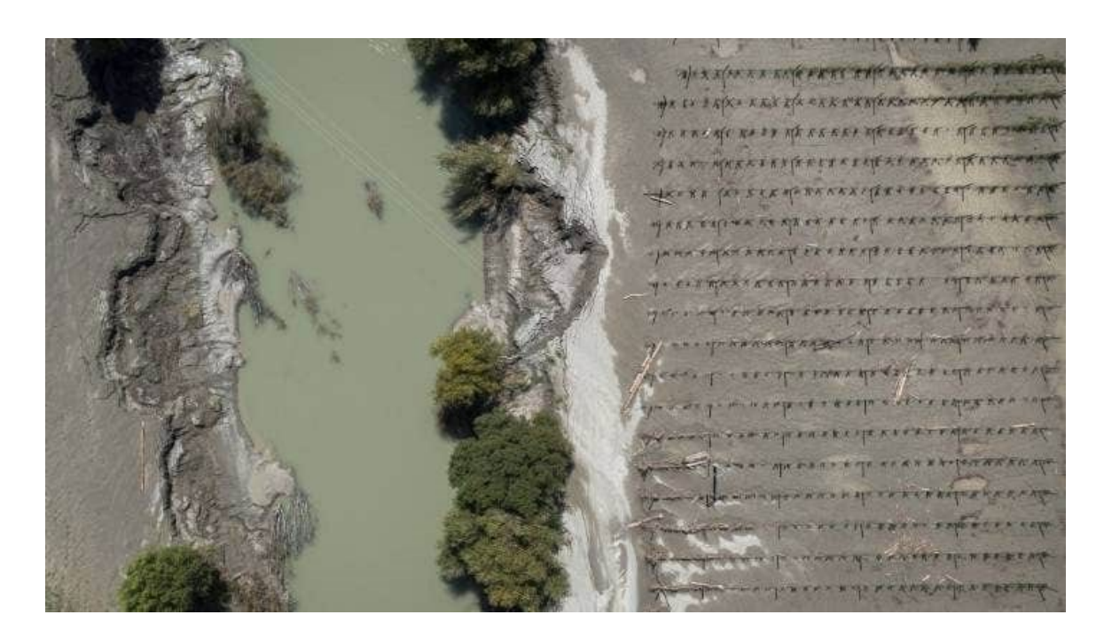
Damage to the Pine Valley Orchard which is on the banks of the Nuhaka River, between Gisbone and Wairoa.