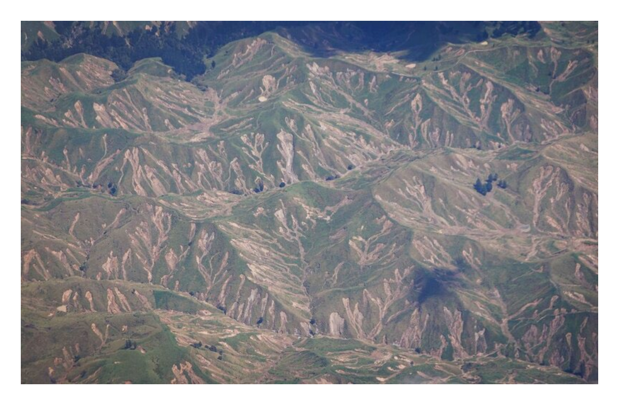
Erosion on pastoral hill country was immense.

The hill-country was overwhelmingly the highest risk activity and had the least priority for management in the proposed plan.