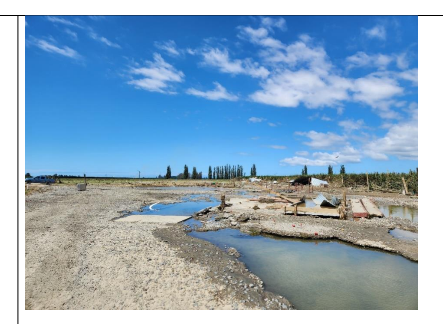
Hawkes Bay 5 Ha of 2d apples - destroyed.

• The first image shows debris left behind by the flood water where a shed was destroyed, and the entire orchard disappeared. This whole image should be 5ha of 2d structure of apple trees.