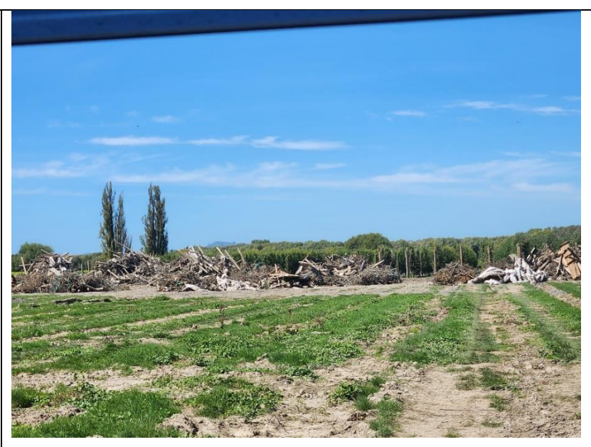
Sorted piles of waste debris left following the destruction of the orchard.

• The second two images are the piles of debris that have been collected where the 5ha were lost.