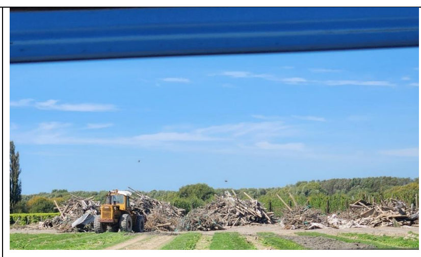
Mixed piles, that cannot be further separated.