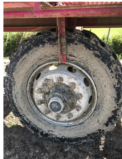
Figure 3: Wheel scraper device attached to a farm vehicle.

The transport vehicle should be located on a hard surface loading pad for further road transport. This can be done using pallets to transfer harvested produce. It helps prevent 'dirty' vehicles entering 'clean' zones, such as public roads or other properties if there is a biosecurity contamination issue.