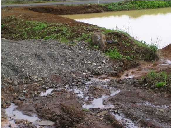
Figure 5: Example of a raised accessway.