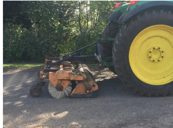
Figure 4. An example of road cleaning equipment attached to a tractor. Mud on the road poses a safety hazard making the road slippery.