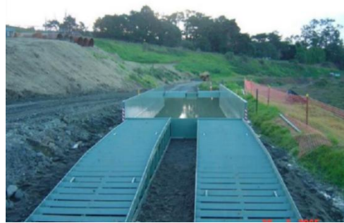
Figure 1: Example of a shaker ramp for physical sediment removal.

A non-water-based sediment removal system is cattle-grate style shaker ramps. These are often installed at site entrances and exits 6 . Figure 1 provides an example of this type of sediment removal system. Shaker ramps are best for small quantities of dry material/soil. Use wheel washing for soil and material in tyre treads 6 .